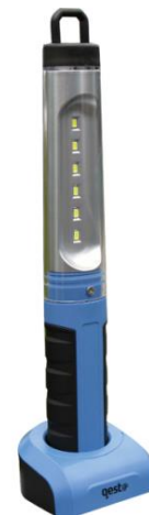
Qesta 6 LED 250 Lm Rechargeable Work Light