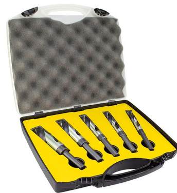
Alpha Reduced Shank Metric Drill Set 5 Pcs 14,16,18,22,25