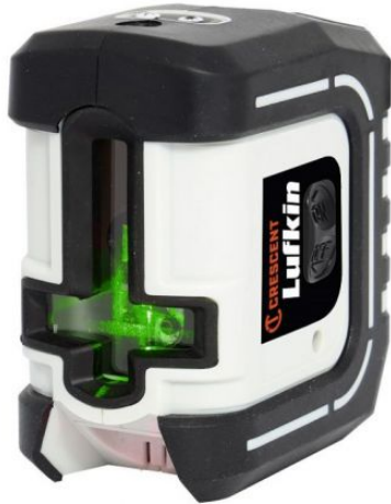
Lufkin Cross Line Laser level Green 8m Range $159 ex GST