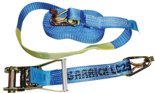
Garrick Ratchet Tie Down 50mm x 9 metre 2.5T 5 Pack $90 ex GST