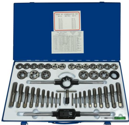
ProEquip 45pc Metric Tap & Die Set m6 – m24 $165 ex GST