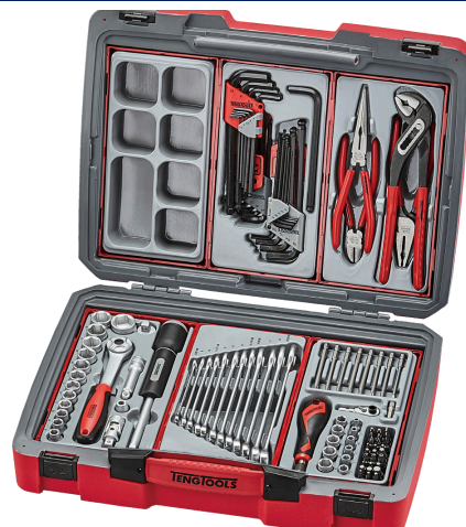
Teng Tools 114 PC Portable Tool Kit $330 ex GST

Northern Engineering & Welding Supplies Ltd