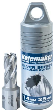
Annular Cutters from 10mm diameter x 25mm depth